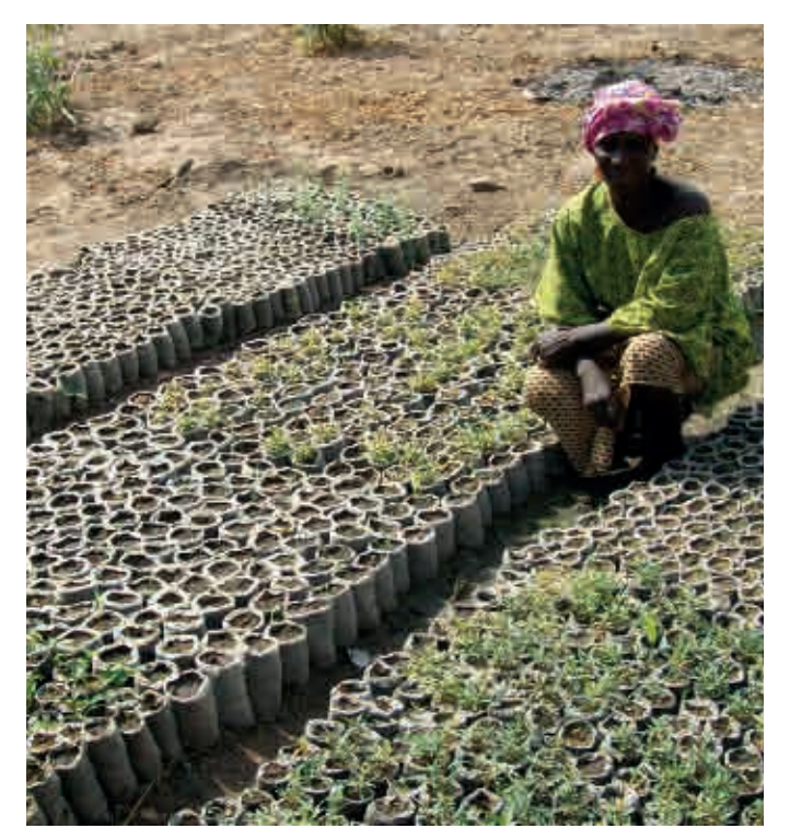
Tree seedlings in the Bendougou Nursery, in Mali, where agroforestry strategies have been widely implemented on cropland.

A more beneficial alternative, from an ecosystems perspective, is to create a multi-functional land use system. For example, native tree species can be planted together with shade-tolerant agricultural cash crops – such as coffee, cocoa or cardamom – or non-timber forest products such as rattans or medicinal plants. Such an approach also ensures economic viability and may improve biodiversity, ecosystem services and carbon capture, benefiting local communities and society as a whole.<sup>11</sup>