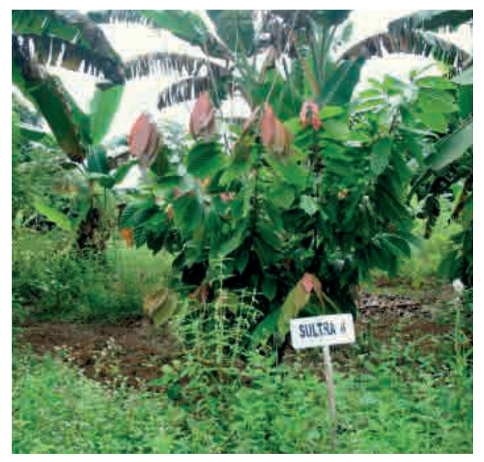
A cacao agroforestry system demonstration at the Cacao Research Sub Station in Sulawesi, Indonesia.

In 2011, the Global Partnership on Forest Landscape Restoration published a map of forest restoration opportunities around the world: 2 billion hectares from northern Canada, to sub-Saharan Africa. Up to half a billion acres, the project found, would be suitable for wide-scale restoration of closed forests; the remaining 1.5 billion hectares, it showed, were best-suited for "mosaic restoration", in which forests and